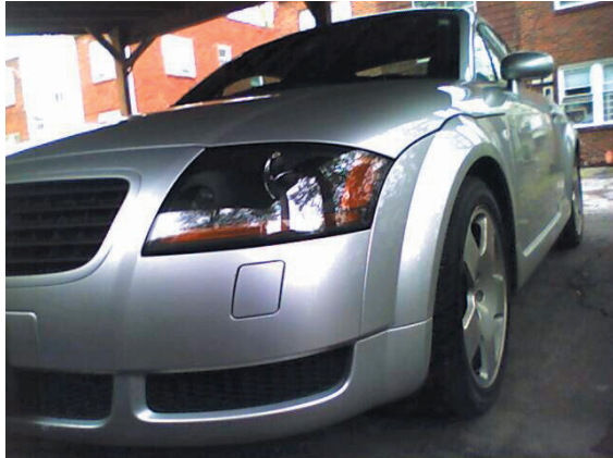
JPEG - photograph with shades of color

GIF format is intended for line art with large areas of solid colors and uses a "lossless" compression scheme