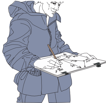
GIF - line art with solid colors